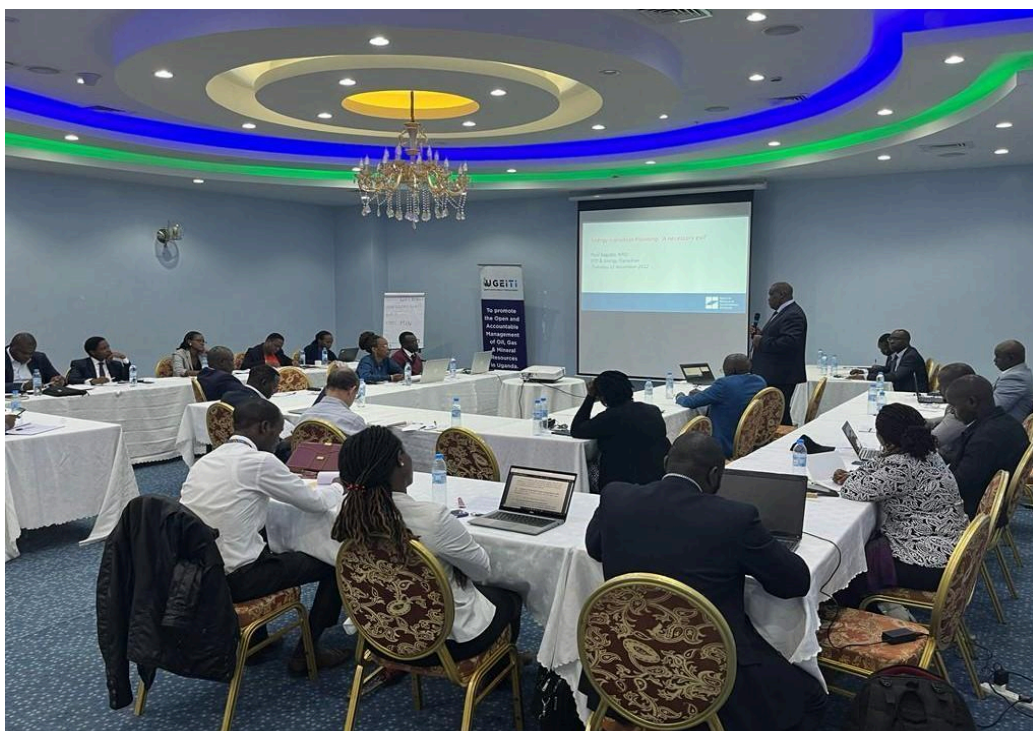
Training workshop on Energy Transition Planning and EITI held on 22 nd November 2022

a) UGEITI in conjunction with Natural Resource Governance Institute for energy governance held a training workshop for MSG on energy transition as well as civic space.