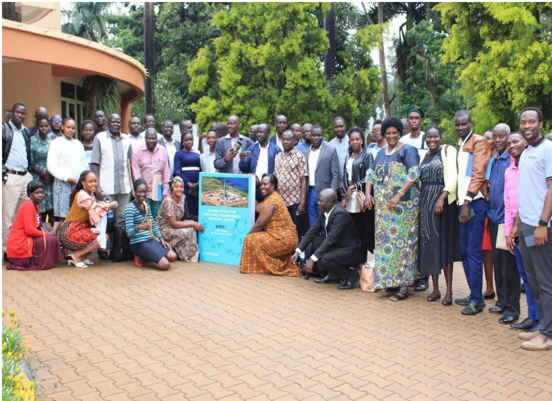
Dissemination of the first UGEITI report and workplan consultations with stakeholders in the Eastern region – Mbale District on 30 th August 2022

During the period under review, the MSG held a number of engagements and dialogue meetings with different stakeholders to disseminate the findings of the first UGEITI report. This was done with support from civil society that supported engagements with members of Parliament and in creating awareness among communities in the extractive regions like Karamoja. Civil Society Organizations like CSCO, ACODE, GRA and Resource Rights Africa among others collaborated with the UGEITI Secretariat in disseminating the 2019/2020 report across a wider audience.