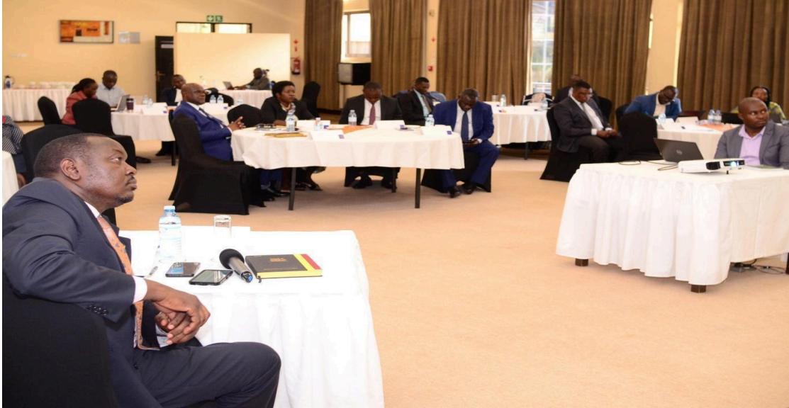
EITI Dissemination and Capacity Enhancement workshop for the Environment and Natural Resources Committee of Parliament held on 30 th November 2022