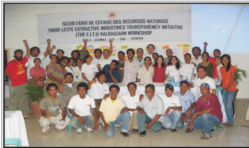
Civil Society is important element in the EITI process, in this picture we see representative of local NGO from 13 Districts in Timor-Leste participating in one of the many EITI Workshops held in Timor-Leste.