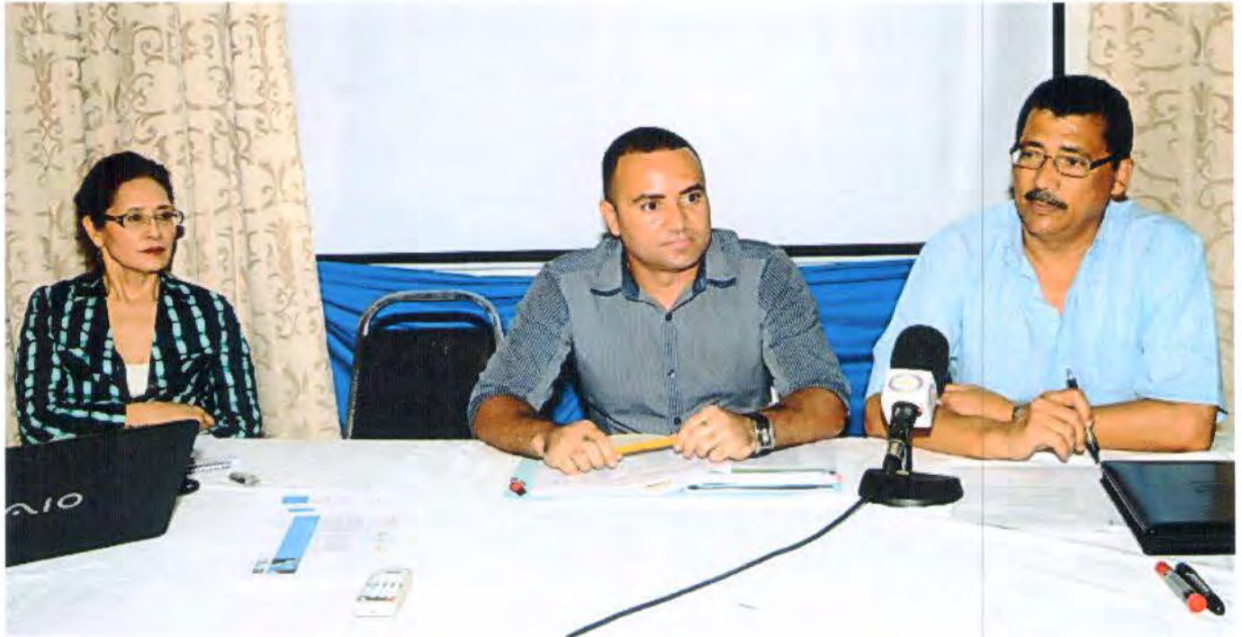
The multi-stakeholders committee meeting in progress