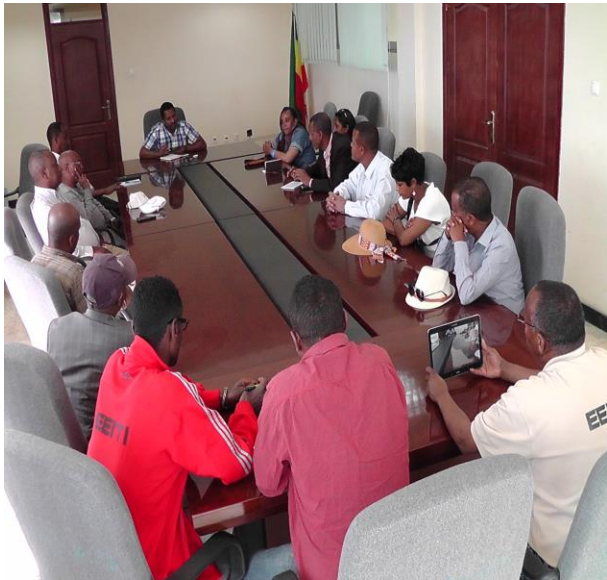
Discussion during Mosobo