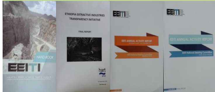
Disributed EEITI Promotional materials