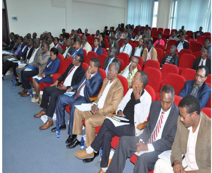
Stakeholders EEITI Act Debate