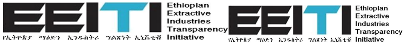
Some of the Distributed EEITI Documents

One of the major achievements of the EMSG is the production and distribution of EEITI promotion materials to its stakeholders and the general public to further foster awareness of the EITI implementation in Ethiopia. To this end, the EMSG has distributed EEITI LOGO printed bags, caps and T-shirts during various awareness creation workshops and occasions. Moreover, various printed EEITI documents were also distributed to the concerned stakeholders on different occasions and also by moving around on their office location.