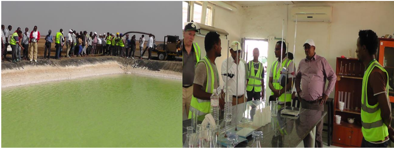
Some of the photos from the visit of Mining site (Potash & Muger)