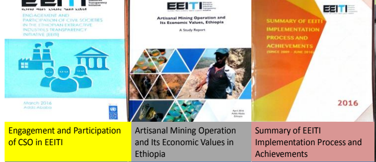
Disributed EEITI Promotional materials