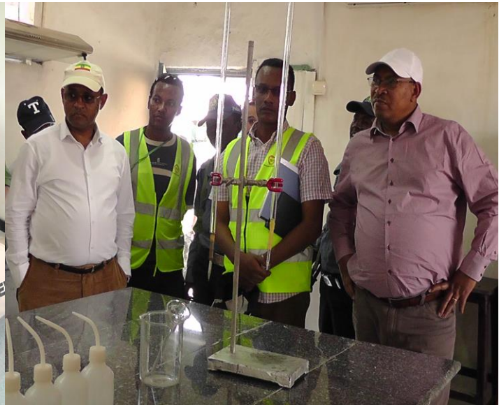
EMSB Potash Site Visit together with Ministers