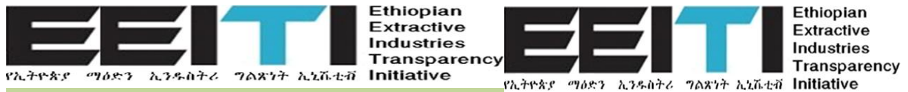
Some of the Distributed EEITI Documents